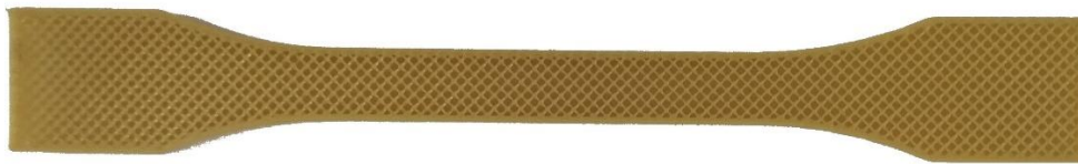
Figure 1. Cross-section of the sample with 30% grid filling

In addition, a heated table was used, with temperature set at 60 \pm 5^\circ\text{C} . The adopted value of the degree of filling of the samples, i.e. 30% resulted from the author's previous research. It is a polyoptimum value in terms of print time and strength of the samples (Miazio, 2015). The fittings were printed with a 45^\circ angle grid filling (Fig. 1) relative to the sample axis. The printing speed has been changed from 20 \text{ mm} \cdot \text{s}^{-1} to 100 \text{ mm} \cdot \text{s}^{-1} .