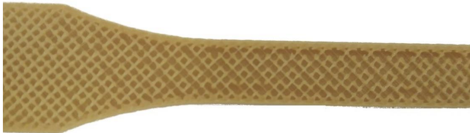
Figure 4. Printing defects - printing speed 100 \text{ mm}\cdot\text{s}^{-1}