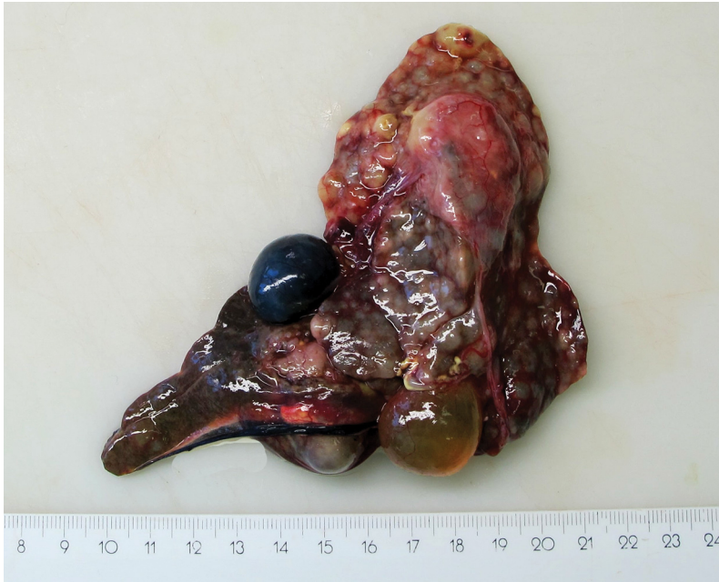
Figure 5. Liver cholangiocarcinoma. Markedly enlarged liver with multiple coalescing yellowish nodules and multifocal cystic changes.