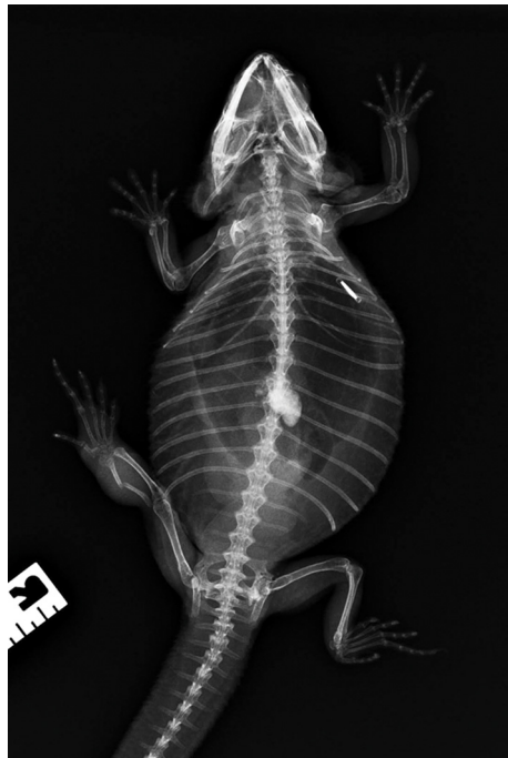
Figure 3. X-ray of right pelvic limb on unsedated animal. A single transverse fracture of the right fibula and swollen soft tissues are evident.

Sudden deterioration of the overall health condition occurred two months after amputation of the affected limb. The patient was apathetic and stopped eating. Ultrasound examination of the coelomic cavity was performed by Mindray M7 (Mindray DS USA Inc., Mahwah, USA) with an 8 MHz microconvex transducer. Significant enlargement of the liver with presence of multiple cystic anechoic structures with clear distal signal amplification was observed (Fig. 4) and liver neoplasia was the presumed diagnosis. Blood was obtained for haematological and control biochemical examination. All biochemical and haematological parameters were within normal range. Due to poor clinical status and the ultrasonographic finding, the animal was euthanized. A combination of propofol (5 ml pro toto) and T61 (1.5 ml pro toto) (Intervet International BV, Boxmeer, The Netherlands) was administered into the ventral coccygeal vein. Successful euthanasia was verified by acoustic oscillometric examination of the heart.