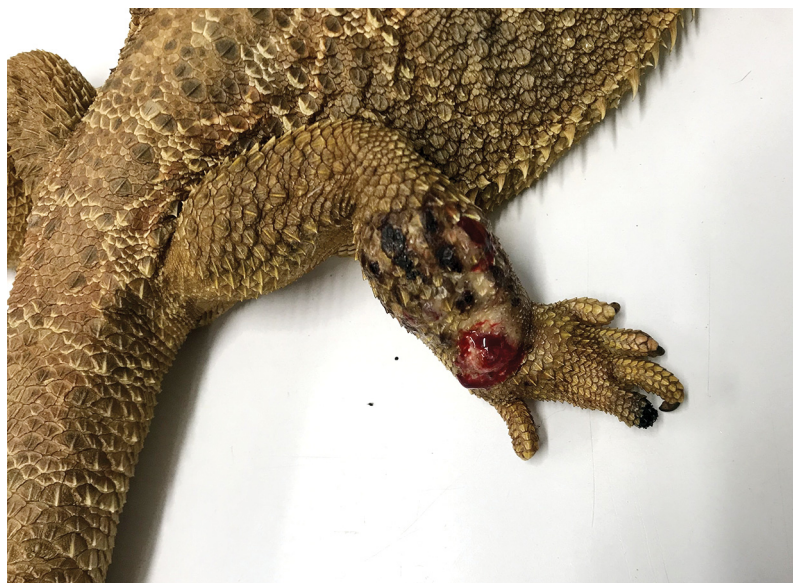
Figure 1. The swollen pelvic limb with skin ulceration during the initial clinical presentation

Clinical examination revealed a deteriorated nutritional status with a body condition score of 2/5. The body orifices showed no discharge and the animal's breathing was calm. A marked swelling of the right shin with skin ulcerations was the main finding (Fig. 1). The swelling was approximately 2.5 cm in diameter and the skin ulceration