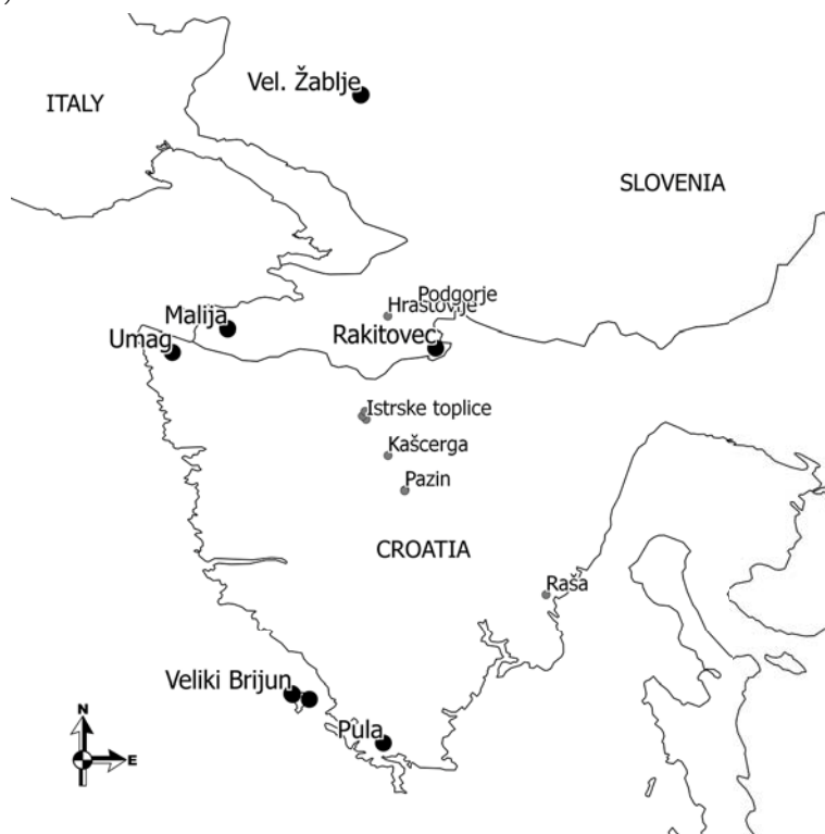
Figure 1. Map of the Istrian peninsula showing locations of investigated illegal waste sites (●positive sandflies sites; ●negative sandflies sites)

The study was conducted on the Istrian peninsula, which is the largest region on the Adriatic Sea located in its Northeastern part and includes portions of Croatia, Slovenia and Italy. The climate of the region is Mediterranean and Sub-Mediterranean with dry and warm summers and mild winters. The average annual air temperature along the northern coast is around 14°C and 16°C in the southern area and islands. It snows very rarely. The entomological and rodent surveys were carried out at selected and marked illegal waste sites along the study area between April 2011 and May 2013 (Figure 1).