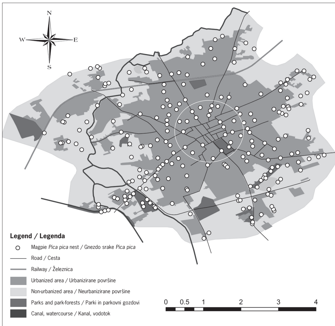
Figure 1: Distribution of Magpie Pica pica nests over the study area of Sombor in 2009. White circle separates the town centre from the residential area.