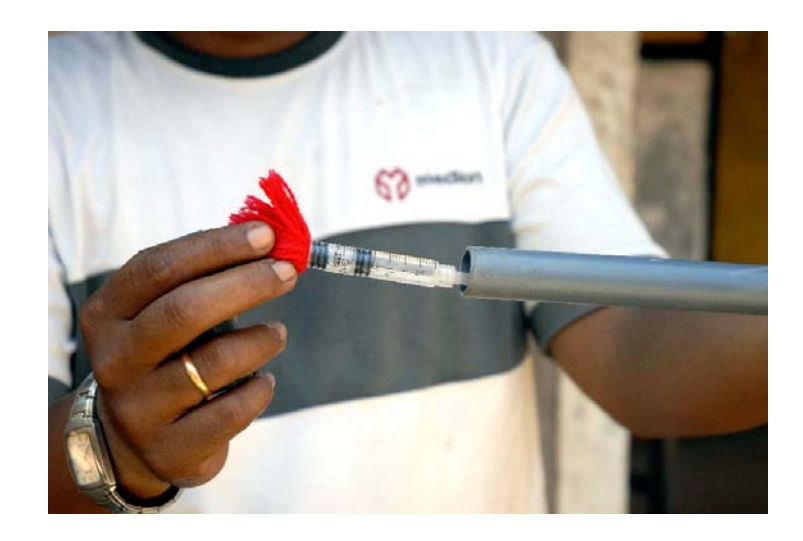
Fig. 3 The strychnine dart being prepared in Bali.

to deliver a deadly dose of strychnine (Fig. 3). In several published papers, the Australian team was critical of the failure of the Indonesian government to bring an end to the Flores rabies outbreak. Yet the methods that were advanced in Bali were essentially the same as what had failed in Flores 8 years before [12, 13]. Limited vaccination was initially done only in the areas where rabies cases were known to have occurred. For most of 2009 the government vaccination effort used low potency vaccines of Indonesian manufacture which were believed to require revaccination after only six months, meaning that the entire vaccination campaign had to be continually repeated. Lack of coordination between the vaccination teams and dog poisoning teams made matters worse, as vaccinated dogs were frequently poisoned, leaving habitat open to unvaccinated dogs from areas with rabies. BAWA, from November 30, 2008 until approximately one year later, repeatedly attempted to obtain government permission to import three-year vaccines and do intensive dog vaccination, under a memorandum of understanding which would ensure that vaccinated dogs would not be killed in poisoning sweeps. Failing to secure the necessary memorandum of understanding with Balian provincial agencies, BAWA eventually began working at the regency level instead, vaccinated more than 80% of the dogs in Gianyar regency, and as of the beginning of June 2010 is moving to do likewise in Bangli regency.