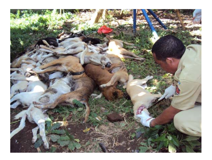
Fig. 2 A day's work culling dogs in Bali.

2008 and the first week of September, just on the opposite side of the Denpasar International Airport from where rabies had begun to spread, unchecked and unnoticed, through the isolated Balian southern peninsula. The Asia for Animals conference spotlighted the work of the Bali Street Dog Foundation, the Yudisthira Foundation, and the Bali Animal Welfare Association, who among them had sterilized more than 20,000 street dogs during the preceding decade, primarily in the densely populated tourist areas south and east of Denpasar, the Bali capital.