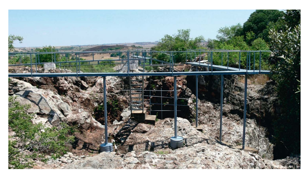
Figure 2. Sterkfontein cave site - place of discovery of Australopithecus africanus

Apart from the "Taung Child" (a partial skull together with a natural endocast <sup>3</sup> of the brain), other best known australopith individuals, who received nicknames, are: "Mrs. Ples" (complete cranium), found by Robert Broom (1947) at Sterkfontein, and "Little Foot" (a spectacular near-complete skeleton), whose bones were first found in 1994 in a box, and subsequently in-situ between 1997-99 by Ron Clarke (1998), also within the Sterkfontein cave system. The most recent discovery included the remains of two individuals (which were given a new species name – Australopithecus sediba ), found at Malapa by Lee Berger in 2008.