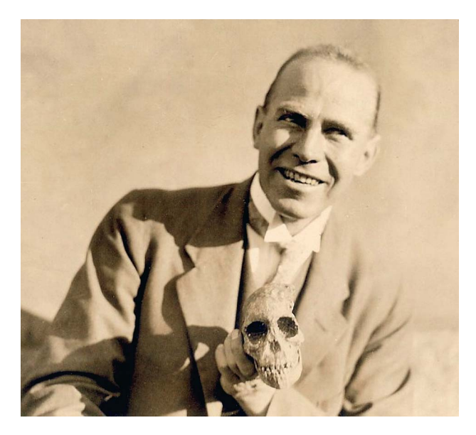
Figure 4. Archival photograph of Raymond Dart holding the Taung skull

Having been to South Africa a few times, the above endeavor was more than just research, but an 'adventure' into the distant past – something which I had aspired to since a young age.