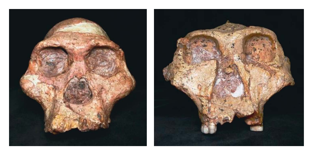
Figure 1. Two australopithecine skulls from South Africa: (left) Australopithecus africanus from Sterkfontein (gracile form) vs. (right) Australopithecus robustus from Swartkrans (robust form) (photos by K.A. Kaszycka)

foods. In relation to the australopithecines two descriptive terms are commonly used – the so-called "gracile" and "robust" forms <sup>2</sup> (see Fig. 1).