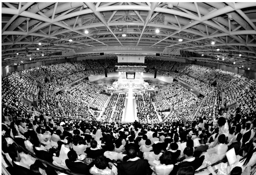
Figure 2 Foundation Day ceremony at the packed CheongShim Peace World Center on 22 February 2013

This ‘crucial point’ in salvation history was scheduled on 22 February 2013, 10:00 a.m. Korea time as the ‘greatest celebration of the greatest day in human history’ (Yang and Kim 2013), reportedly attended by 50,000 believers on-site in the CheongShim Peace World Center (Figure 2)—which also served as the venue of Mun’s Seonghwa—and followed by three million members in 194 countries via live broadcast.