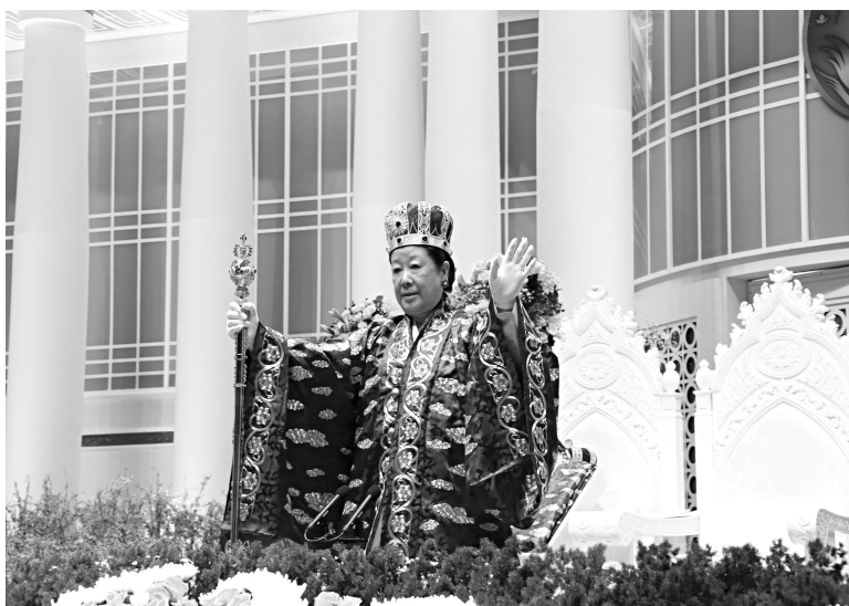
Figure 3 Han Hak-Cha at the Cheon Il Guk Proclamation ( ch'ōnilguk sōnp'o 천일국 선포), wearing the royal insignia as True Parent of Heaven, Earth and Humankind 53