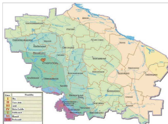
Figure 2 Climatic zones of the Stavropol Region in terms of humidity

The specialisation of agricultural production influences the level and sustainability of rural development in those areas. Analyses of decided differences in social, environmental and economic development of separate