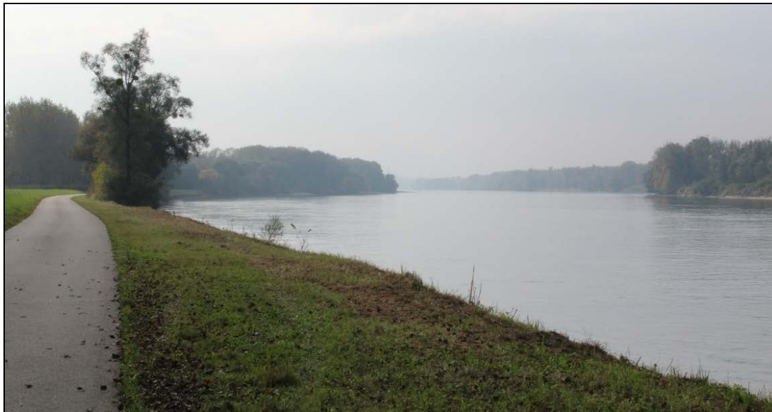
Figure 3: Impoundment of Ybbs-Persenbeug, one of the ten run-of-river plants at the Austrian Danube. Prior to “rectification” in the 19th century, the river had at this site anabranching channel morphology.