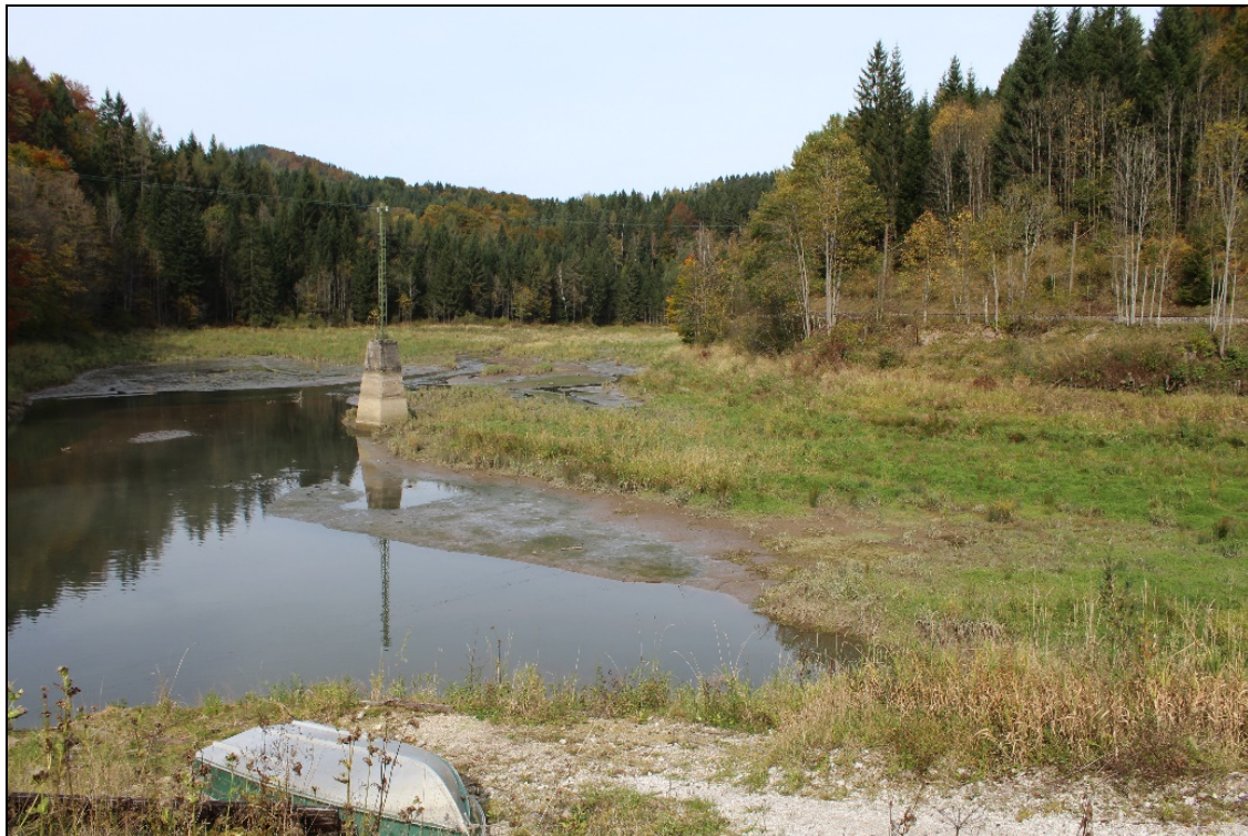
Figure 2: Reservoir siltation at the Erlauf River, a Danube tributary. The water level is drawn down to allow dredging of deposited gravel, sand, and fine material.

This proves that processes and challenges associated with hydropower and fluvial sediment regime were known among technical experts at least since the early 20th century, especially those deriving from a surplus of material. However, what was the role of this knowledge in actual project planning? The engineers designing the Wienerbruck power station, which was the first genuine storage plant in the Austrian monarchy and completed in 1911, had to deal with various challenges, from applying untried technology in a harsh Alpine environment to negotiating with other water users (e.g. timber floating). Sediment continuity is not an issue they addressed in their plans, nor do the preserved legal documents suggest that authorities regarded interrupted sediment transport as problematic, as no respective measures were prescribed. However, later archival material shows that the two reservoirs connected with this plant had to be dredged or flushed several times over the following decades (the larger reservoir at least in the 1940s and 1970s, the smaller one was dredged only a few years ago, Fig. 2). These measures are necessary to maintain the functioning of the reservoir, but are associated with reduced electricity production over a certain period of time and can have negative effects on aquatic organisms (Jungwirth et al., 2003).