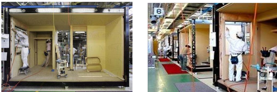
Figure 1: Toyota homes – prefabricated house through lean production in the factory [13, 14]

In the 1970's, Syohichiroh Toyoda started a housing business (Toyota Homes), trading on the experience in automobile production in terms of quality, reliability and high levels of investment in advanced manufacturing techniques. The success of these houses is due to their application of a technique to a particular type of product in a particular situation, which would be difficult to reproduce elsewhere due to political, more than technical, reasons. Evidence from the 1960's suggests that systems building did not raise overall productivity (except in school building projects), and was rarely cheaper or much quicker than traditional construction techniques. Further, it often resulted in products that were socially unacceptable [11]. This fact confirms the knowledge of the drivers and barriers of prefabrication in construction industry [12].