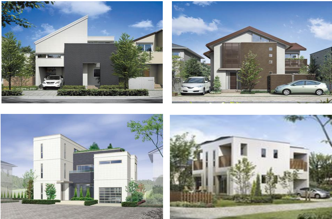
Figure 2: Diversity of architectural solutions of industrialized houses [15]

modern sustainable construction. In the present, we are witness of design boom in Asian countries. This design boom is connected with the new architectural solutions of prefabricated houses (figure 2).