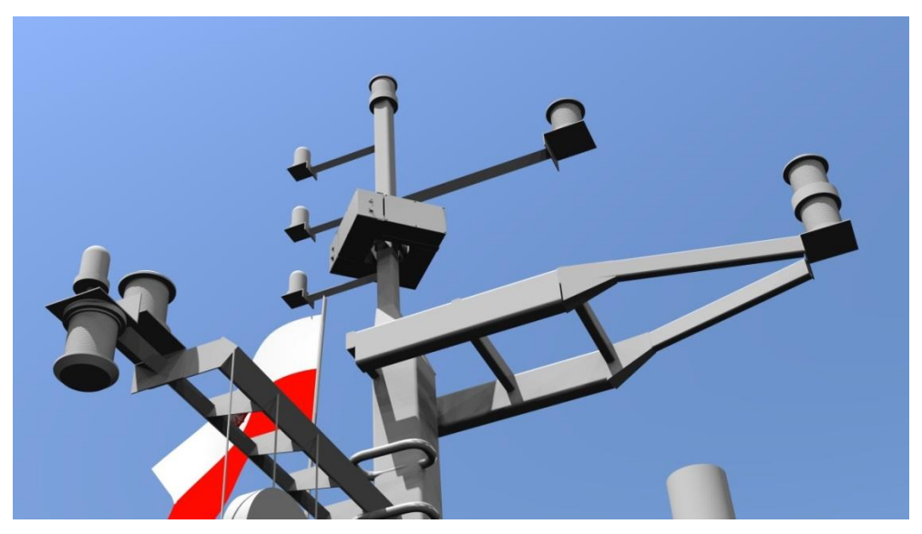
Fig. 2. The combination 4 sections of antenna system model

Getting the right heights is often impossible. One of the desirable solutions, especially in communication with unmanned platforms, is a virtual mast (platform of, among others, observation sensors) allowing for a height increase of 100 m. It will be particularly advantageous to increase the antenna suspension height at coastal stations acting as repeaters up to 100 m. It is not technically possible to extend the range beyond the horizon by increasing the height of the antenna system, so it is necessary to use tropospheric communication, for which it is possible to form a beam with a power of up to 40 dBm in the antenna system.