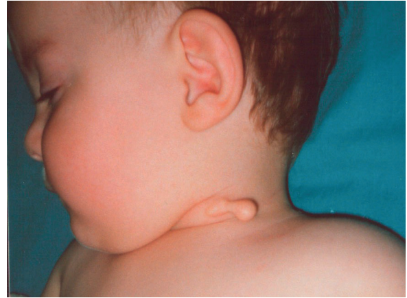
Figure 3 Local findings in case 2

openings of the channels into the mouth. Ophthalmologists and otorhinolaryngologists were consulted, and the patient had no other anomalies. All of the tumours were completely removed together with the fistulous channel to the level of the facial muscles. Histopathology confirmed that this was an inherited anomaly (Figure 2). He was discharged from the hospital on the 3 rd postoperative day with no complications, and at the last follow-up examination three months after surgery, there were no signs of recurrence.