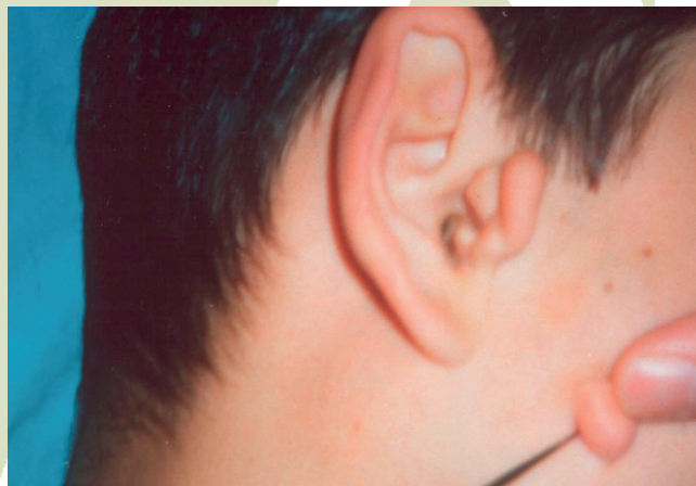
Figure 1 Local findings in case 1 (sound probe in the canal)

A 23-year-old male patient was admitted to the Clinical Center Kragujevac in Serbia for surgical treatment of multiple skin tumours that were localized between the tragus and the corner of the mouth (Figure 1). The largest tumour had a fistulous channel and secreted cerumen. There were no