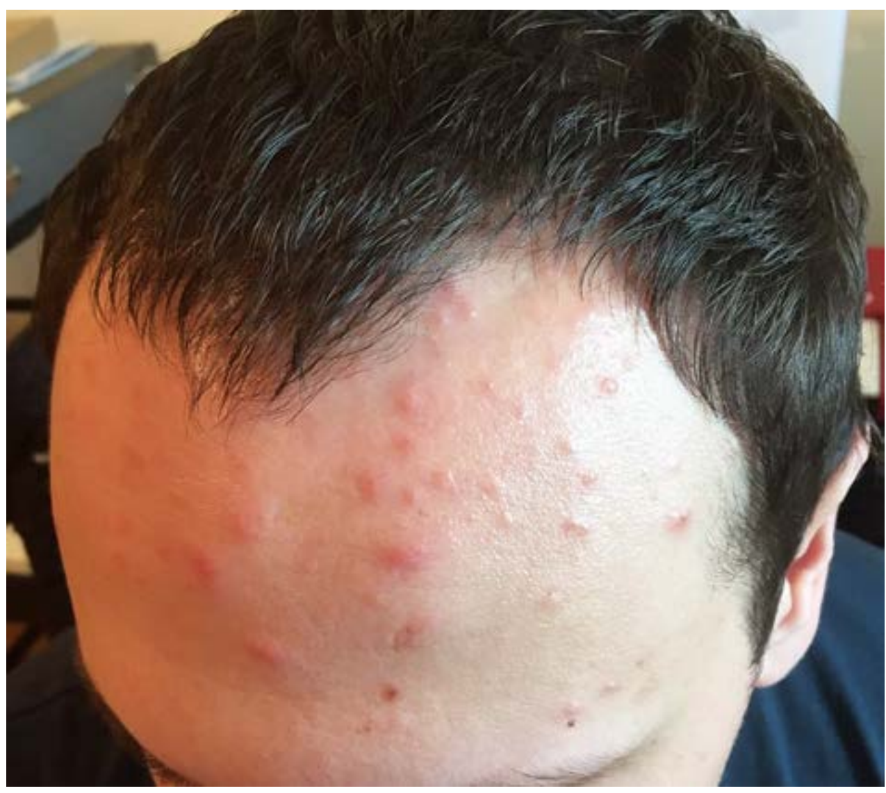
Figure 1. Small, discrete, erythematous papules, up to 2.5 mm without scales

FMF manifests with erythematous, grouped papules or indurated plaques, acneiform lesions, cysts, rarely tumors and patches of scarring alopecia. Lesions are commonly associated with severe pruritus (13, 7). Unlike the common clinical findings of MF, where patches and plaques affect the sun-protected skin, in FMF, papules and plaques occur preferentially on the head and neck region (1).