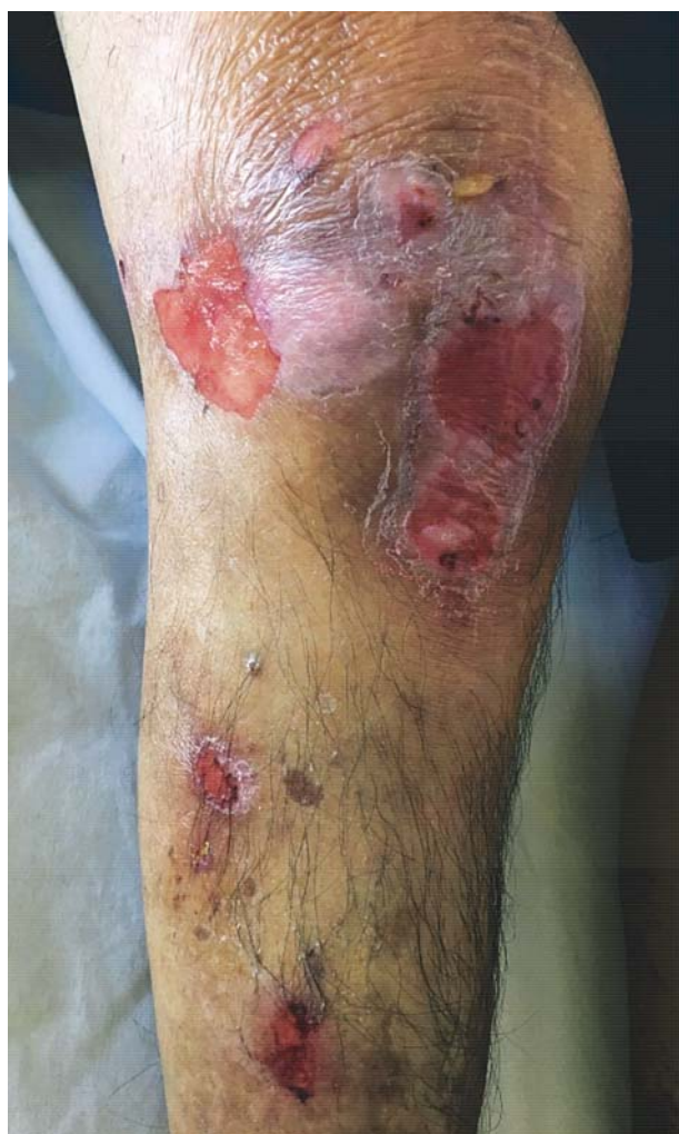
Figure 1. Tense bullae, erosions and crusts on the incision scar site after total knee prosthesis

for: elevated erythrocyte sedimentation rate of 48 mm/h and C-reactive peptide of 31.5 mg/l (normally < 6 mg/l). Other test results, for neoplastic processes, such as tumor markers, chest X-ray and abdominal ultrasound, were all unremarkable.