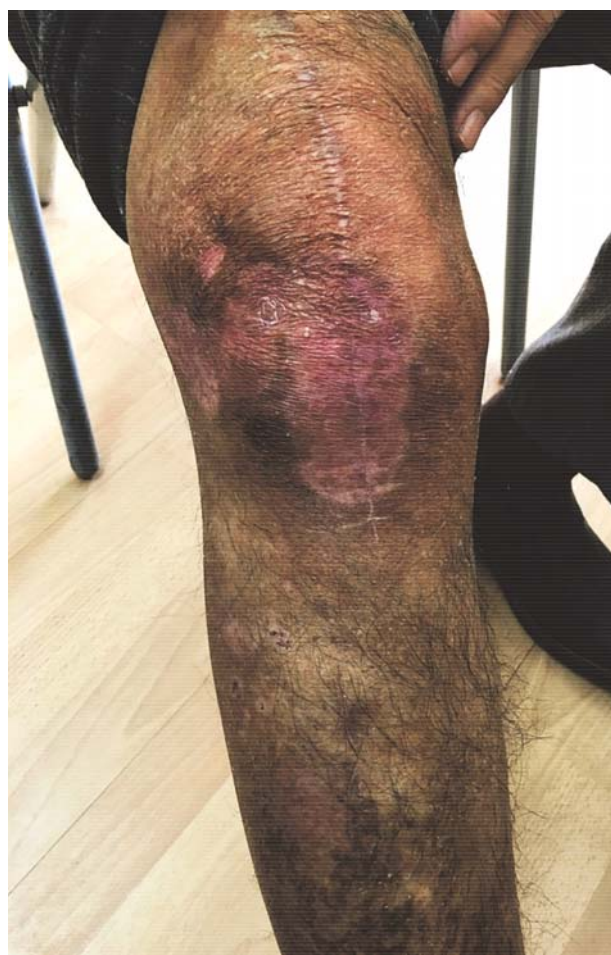
Figure 3. Complete resolution of bullous lesions at the follow-up visit eight weeks later

BP after surgical procedures such as arthroplasty as in our case (2,3), internal fixation of skeletal fractures (17), amputation stumps (13), incisional hernia (14), vascular grafting (7), percutaneous gastrostomy or urostomy (2) etc., are well documented in the literature. Time elapsed from the injury and development of skin lesions varies greatly, ranging from as little as few hours (6) to over 20 years (16).