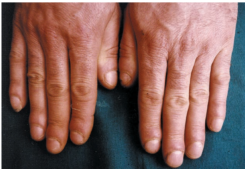
Figure 3. Clubbing of the fingernails: drumstick fingers and watch glass nails

Development of extrathyroidal manifestations, such as ophthalmopathy and pretibial myxedema, is associated with positive feedback mechanisms including mechanical (trauma/pressure), immune (accumulation of immune cells, inflammatory cytokines, increased expression of TSHr) and cellular processes (adipogenesis, increased production of glycosaminoglycans/prostaglandin E 2 ) (11). "A subclinical systemic inflammatory process might develop in Graves' disease as activated T cells and