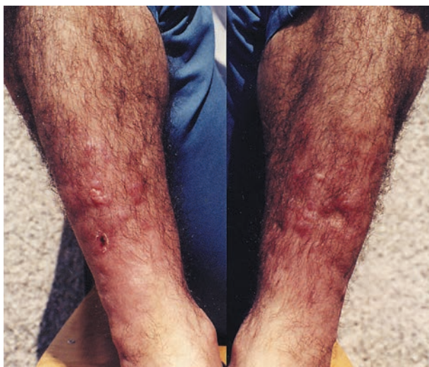
Figure 2. Pretibial myxedema: bilateral, almost symmetrical, clearly defined painless infiltrates and nodules of firm consistency, showing mild erythema and uneven surface with orange peel appearance

(Figure 5). The dermis layer was thickened and collagen fiber networks were cross-linked. Fibroblasts were present, within normal levels, some star-shaped. Mucin dermal deposits were scarce in the papillary and more prominent in the rest of the dermis, presenting between abundant collagen fibers.