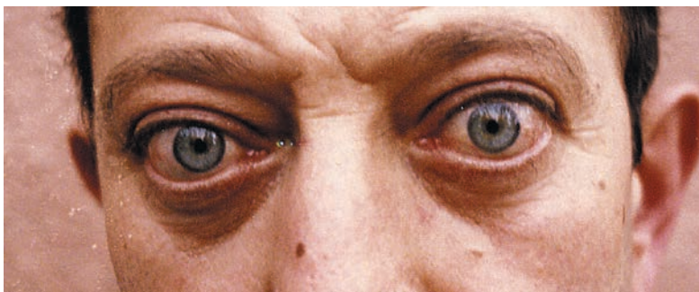
Figure 1. Exophthalmos

Histopathological findings: the corneal layer and epidermis were without prominent changes