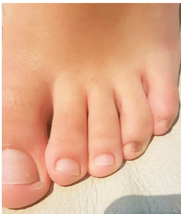
Figure 3. Partial regression of pigmentation after one-year follow-up

Longitudinal melanonychia, also known as melanonychia striata, is clinically manifested as a longitudinal streak of tan, brown or black pigmentation extending from the matrix along to the tip of the nail plate (1, 2). Depending on the number of nails involved, it can be presented in a form of single or multiple longitudinal melanonychia (1, 2).