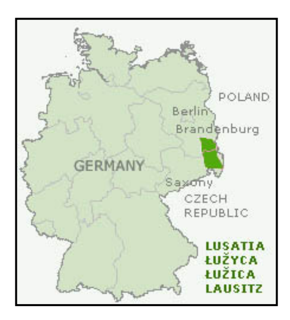
Figure 1: Lusatia in Germany (map)