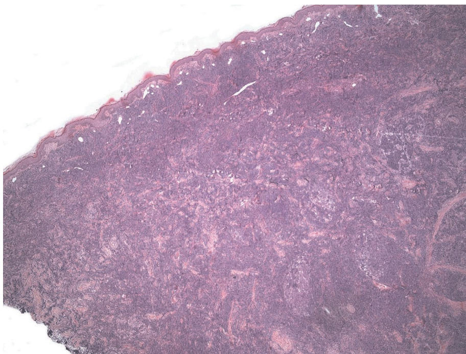
Figure 1a. Diffuse full-thickness infiltration of the skin by mature small size lymphocytes admixed with reactive follicles (HE stain, 4X).