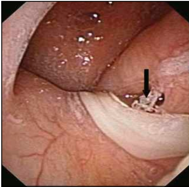
Figure 4 An endoscopic view of the nasopharyngeal space. The band of mucopurulent discharge flows over the Eustachian tube orifice (black arrow) and continues downwards to the hypopharynx, consequently causing deglutition (postnasal drip).