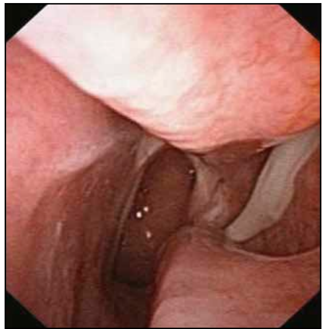
Figure 3 Endoscopic view of the internal half of the left nasal cavity. The whitish band of mucopurulent mucus flows towards the tail of the left inferior turbinate.

maxillary sinus gradually rises, the only way out is the spontaneous rupture of the weak point, i.e. the fontanel. The same is true for cases which are still treated using an old, fortunately almost abandoned technique: maxillary sinus puncture. The high pressure of the saline during the irrigation can produce the rupture of the gentle fontanel tissue since there