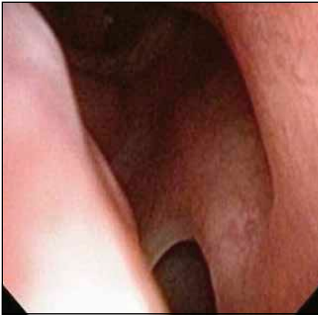
Figure 1 Close up view to the superior border of the left-sided defect of the posterior fontanel.