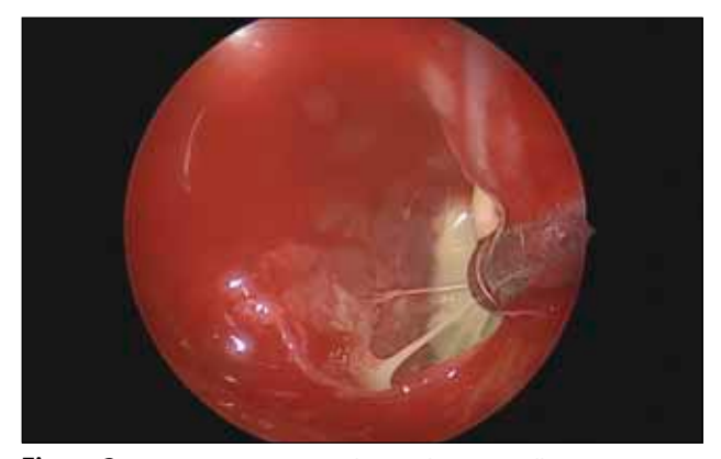
Figure 3 Intraoperative aspect-endosinusal view (maxillary sinus).