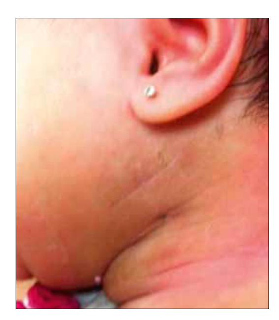
Figure 7 The little baby 2 weeks after the surgery

Contribution of authors: All authors have equally contributed to this work.