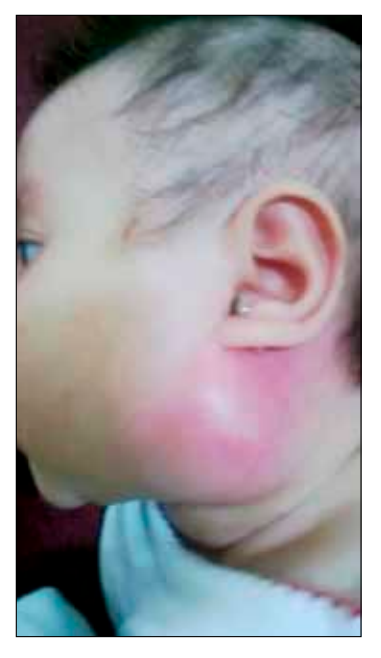
Figure 1 Physical examination