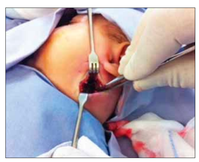
Figure 5 Intraoperatory view