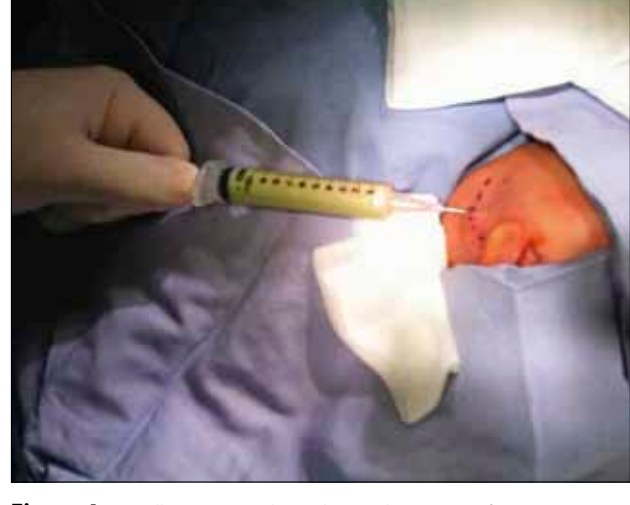
Figure 4 A needle aspiration drained more than 10 mL of pus