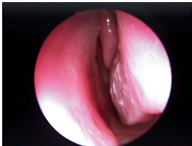
Figure 1 Hypertrophy of the inferior turbinate mucosa – nasal endoscopic examination

In chronic hypertrophic rhinitis (Figure 1), preoperative observations revealed severe metaplasia of the nasal epithelium, evident stratification in the epithelium and hyperplasia, degeneration of epithelial cells, loss of cilia and disruption of intercellular connections. Additionally, increased basilar membrane thickness, edema, nasal mucus overproduction and inflammatory infiltration in the lamina propria were observed. Increased number of goblet cells and submucosal glands was also found and the number of gland openings was increased 14 .