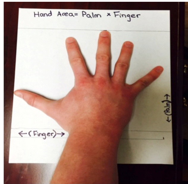
Fig. 3: Hand Size, Showing Hand Area = Palm \times Finger measurements

This study was a crossover trial in which all participants were asked to ventilate patients with both the Tao and standard masks. Descriptive statistics were calculated across all study participants and by randomization group. Associations between randomization groups with categorical variables were compared using chi-square or Fisher’s exact tests where appropriate and with continuous variables using 2-sample t-tests or Wilcoxon ranks sum tests where appropriate to evaluate whether randomization was effective. The