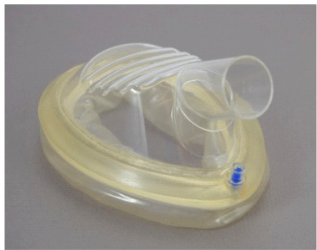
Fig. 2: Tao Face Mask

We hypothesized that mask ventilation by novice operators would be superior with the Tao mask compared to the standard mask (see Figure 2). The aim of this study was to compare the efficacy of this novel mask to the standard mask when used by medical students with no airway experience for manual positive pressure ventilation. A secondary aim of the study was to evaluate the effect of hand size on the efficacy of mask ventilation with the standard and Tao mask.