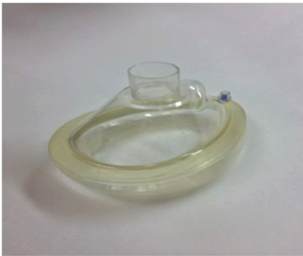
Fig. 1: Standard Mask (Vital Signs® Adult Face Mask with Adjustable Air Cushion Size 5, Manufactured by CareFusion)

and face and lifting of the jaw. The traditional preferred grip is referred to as the C&E technique. This requires the index finger and thumb to form a “C” and push down on the mask to establish a seal between the mask and face. The remaining three fingers (middle, ring, and little) form the “E” and wrap under the jaw to provide lift. The grip required to establish the seal and jaw lift simultaneously is awkward and difficult to teach. The basic design of the standard facemask has not changed in approximately 100 years. The Tao mask design is novel. The airway connector of this mask is located towards the nasal bridge, which provides additional space to hold the mask and seal to the face effectively. The Tao mask allows for the avoidance of the difficult C&E technique and instead encourages a more natural handgrip. With the Tao mask, downward pressure with the palm of the hand centered on the mask provides the seal between the face and the mask. Jaw lift is provided with all four fingers aligned under the jaw. It can be used for one handed bag mask ventilation by individuals with either a right or left handed grip. Two handed bag mask ventilation creates a better seal and is more effective; however, one handed bag mask ventilation is used frequently today in clinical practice. Smaller hand size was associated with the need to use two handed bag mask ventilation and an oral airway in a previous study [2].