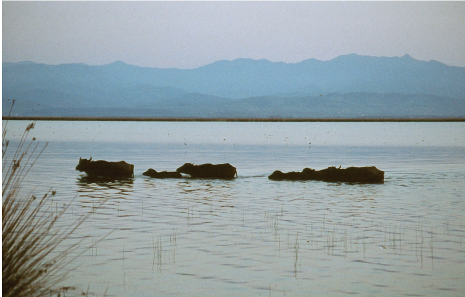
Fig. 2. Lake Cernek and Pontine Mountains - local geographical barriers