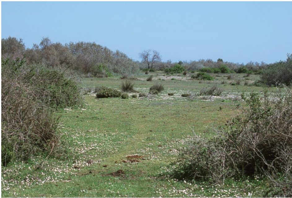
Fig. 3. Dunes and shrubs on the spit which separates Lake Cernek from the Black Sea