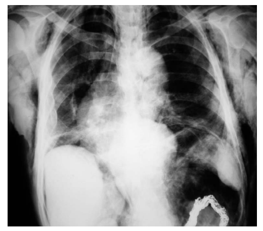
Figure 2. Erect chest X-ray at presentation demonstrates air under the diaphragm, in mediastinum and subcutaneous emphysema.

On examination he had generalised abdominal tenderness with guarding, rebound tenderness, swallowing and diffuse subcutaneous crepitus in the chest and neck area. Rectal examination showed that blood passed per-rectum. Laboratory studies showed a WBC count of 14 \times 10^9 L and 20 \times 10^9 L. A roentgenogram of the chest showed free air in the peritoneal cavity, in the retroperitoneal space in the mediastinum and subcutaneous emphysema (Figure 2). Computerized tomography showed perirectal barium and subcutaneous emphy-