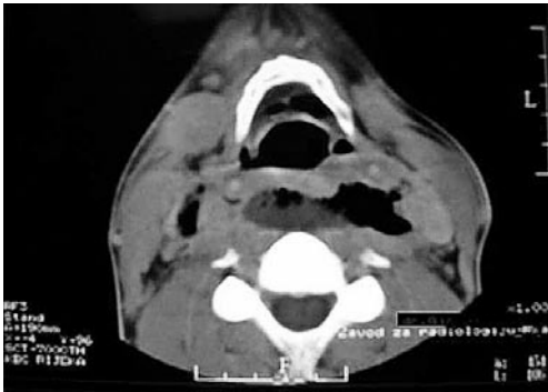
Figure 1. CT of the neck: fluid and gas collections in the retropharyngeal compartments.