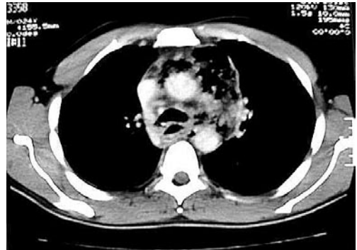
Figure 2. CT of the mediastinum: mediastinal purulence and clear lungs.

the patient was cardiocirculatory instable, with abnormal coagulogram, haematogram and hepatogram. Daily follow-up chest X-rays were performed, and on the 7th day after thoracotomy the follow-up chest X-ray showed lower transparency of lung lobes, indicating a follow-up thoracic CT was required. The CT scan demonstrated enormous bilateral pleural empyemas, with a marked reduction in respiratory space and a paracardial purulence (Figure 3).