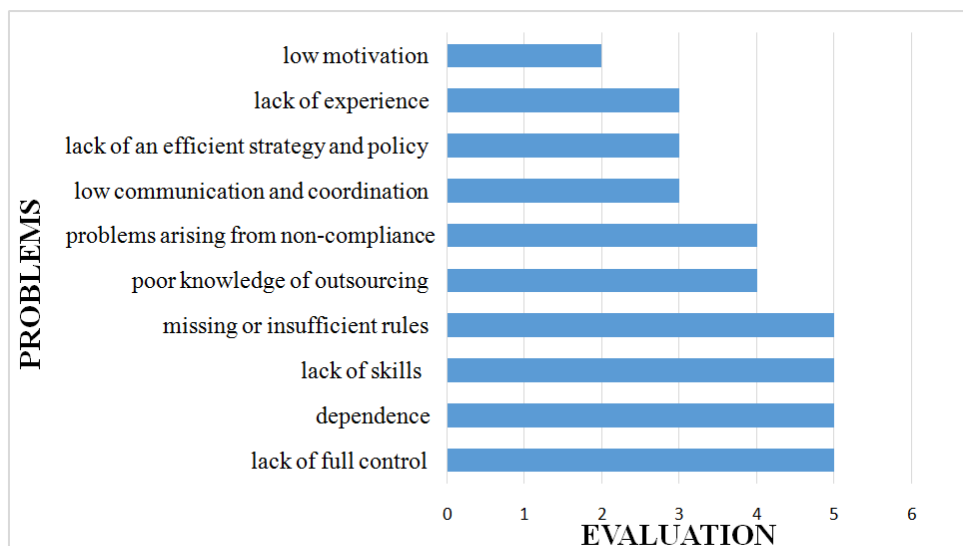
Figure no. 2: Problems related to the increase of the efficiency of outsourcing services in the Bulgarian Armed Forces

using outsourcing services for the overall specific activity of the Bulgarian Armed Forces and on this basis to invest in their optimisation and improvement (Figure no. 2).