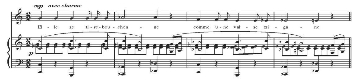
Poulenc, Le bal masqué, Malvina, measures 20-23

The composer seems to allude at a dissociation between how Malvina wishes to appear and how she really is. The dissociation persists in the next lines: some lines allude to an elegant (line 2: son éventail, line 4: son gant gris perle est étoilé d'or, line 9: parfum), lively woman (line 5: Elle se tirebouchonne comme une valse tzigane), rich in moral qualities (line 10: l'honnête, chaste, peu fou), well-educated and cultured (line 12: Agrégé ès lettres et chargée de cours; line 13: C'était en chapeau haut qu'on lui faisait la cour). However, the music accompanying these words appears to be inconsistent with the text, and leads to suspect that what has been affirmed does not meet reality. For instance, the music setting line 5 Elle se tirebouchonne comme une valse tzigane is not a waltz in a simple triple time, and the vocal line is quite static.