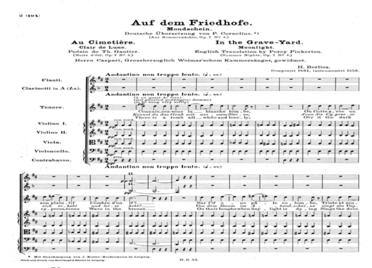
Figure no. 5, Au cimetière, bars 1-20

From the music point of view, we should first note the reduced orchestration: flutes, clarinets and strings. The first two stanzas, the role of which is to set the scenery, are highlighted temporally by the symmetrical three-stroke measure. Although the main key is D Major, the feature of the aria is tierce modulation: (D minor- F sharp minor – A minor; B flat minor – D minor - F minor), in relation to the character's mood swings. It is worth mentioning the orchestral emphasis of the bleak atmosphere in a manner specific to Berlioz: ostinato structures for the string instruments, tremolo effects for the cellos, the voice supported by the clarinet in the acute register (in the dissonant rendering of certain thematic fragments at F sharp/G semitone distance). These practices bring us back to familiar musical moments like the March to the Scaffold of the Dream of the Night of the Sabbath in the Fantastical Symphony , composed during the same period (Rose and Denizeau, 2004, pp. 14-16).