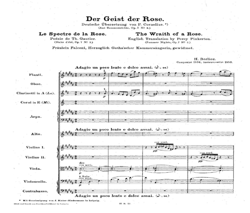
Figure no 2 Le Spectre de la Rose, bars 1-4

crescendo , correlated with the text Mon parfum est mon âme ( This faint perfume is my soul ). As we approach the third stanza, we notice that the original theme is resumed (bar 50). We also note the modulation in the tonality of Et parmi la fête étoilée (bar 58) in accord with the poetic line Et sur l'albâtre... ( And there on the headstone... ), when the voice holds the main role. The last line Ci git une rose que les rois vont jalouser ( Here lies a rose of which kings are inclined to be jealous , bar 62) is sung almost as a declamation (on the rhythm of the words), very slowly, accompanied solely by the sound of the clarinet (Rose and Denizeau, 2004, pp. 6-7).