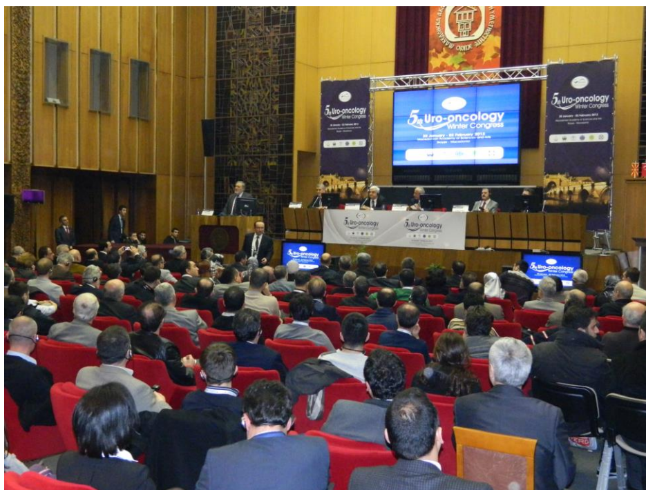
Fig. 2 – Opening ceremony of the Congress