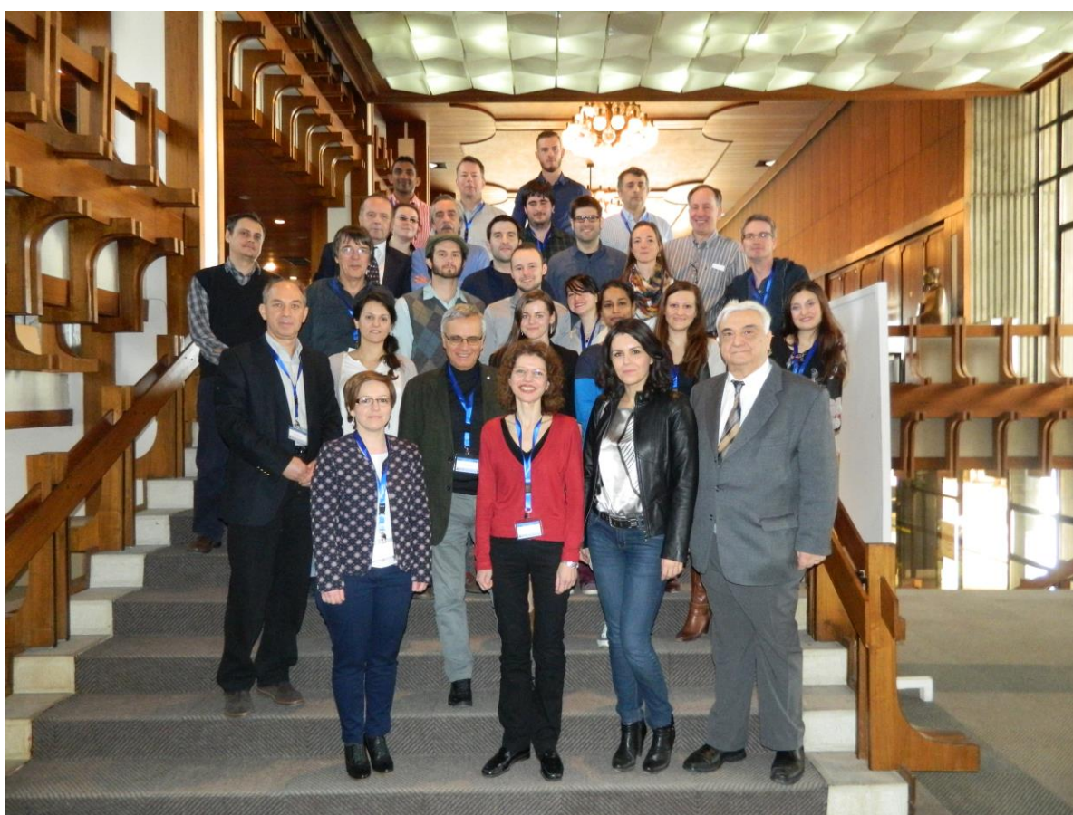
Figure 1 – iMode-CKD and BCMolMed consortium members

A total of 40 researchers attended the meeting from over 13 countries (Fig. 1). The purpose of the Workshop was to present current clinical management issues related to chronic kidney disease. A total of 15 oral presentations were given by renowned nephrologists and experts in multiple issues related to CKD. In addition, two presentations on complementary skills (ethics in science and career advancement) were given by iMODE-CKD principle investigators.