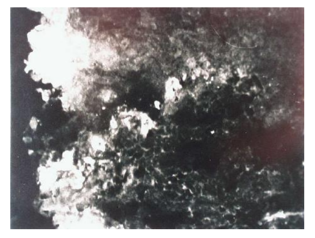
Figure 1 – Deposits of IgA at the epithelial basement membrane and the most superficial layer of lamina propria in OELP