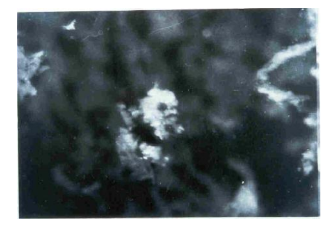
Figure 2 – Deposits of component C3 at the basement membrane, suprabasement in tissue specimens of OELP