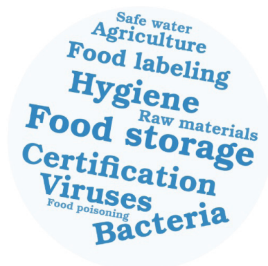
Figure 3. Priorities for local citizens related to food safety.