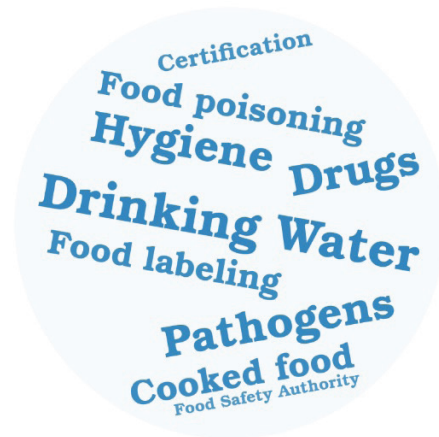
Figure 4. Priorities for tourists related to food safety.