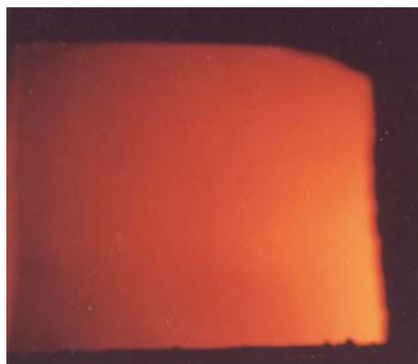
Figure 3. Furnace during injection of reagent

shows the area of the combustion device during injection of reagent GEPERSUITTE 2200.