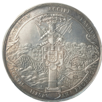
Fig. 5. The obverse of the medal minted by the Dutch West India Company in 1637 in honour of Krzysztof Arciszewski in 1637 (a replica: F. Dekker 1938, fig. 133, after p. 278)

On the reverse of the medal, there is a text providing the reasons for minting and granting