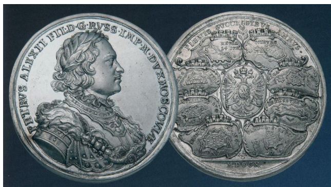
Fig. 2. A medal from 1710 commemorating the capture of Livonia by Peter the Great (P. Krokosz 2017)

In the 17th century, one more medal bearing the testimony of cartographic activity of an inhabitant of the Polish-Lithuanian Commonwealth was minted. It is a medal ordered by the Dutch West India Company in 1637 in honour of Krzysztof Arciszewski. The Company honoured the colonel with a silver medallion and a golden