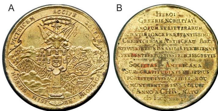
Fig. 4. A medal minted in honour of Krzysztof Arciszewski, 63 mm in diameter and weighing 55.1 g [the specimen auctioned in 2011 (J.W. Adams, D. Verschoor 2011, p. 6)]

The obverse features a lot of details that may pose interpretative problems. In the foreground, there is a centrally placed column commemorating a victory on which there is a shield with the coat of arms of Portugal 13 , a panoply and a laurel wreath. Thus the artist depicts the triumph of the conquest of Brazil and at the same time divides the surface into two parts. Contrary to the suggestions found in literature