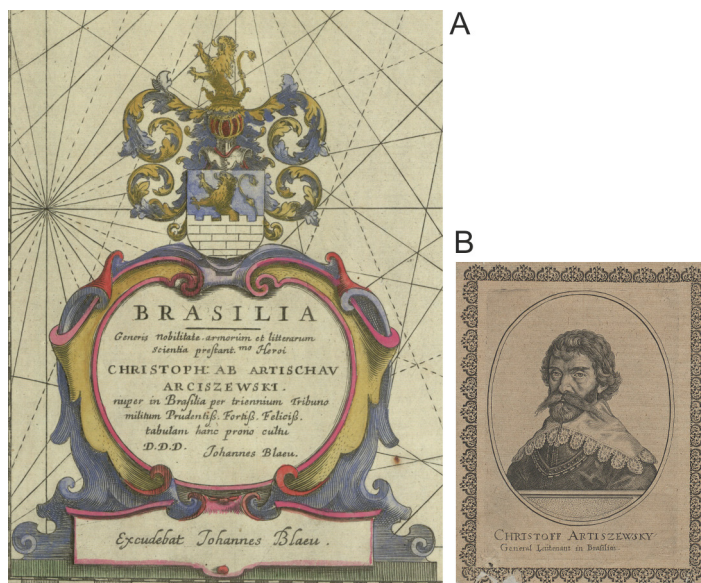
Fig. 9. Jan Blaeu, Brasilia (fragment) and a portrait of Krzysztof Arciszewski; National Library (Biblioteka Narodowa) in Warsaw, ZZK 23 462, G.21871 22 (public domain)

There is one more mystery related to the circumstances in which the medal was made. Today, we know ten specimens of this medal, four of which are kept in Holland 21 . Some of them, however, were not made of bronze and may actually be copies made in the 18th or 19th century. When it comes to silver medals, one of them is in Poland, in the Hutten-Czapski Museum in Cracow (E.Z.M. Czapski-Hutten 1880, p. CXVII, item 6103; E.Z.M. Czapski-Hutten 1916, p. XXXI, item 6103). As the recent research demonstrates, it is the second variant