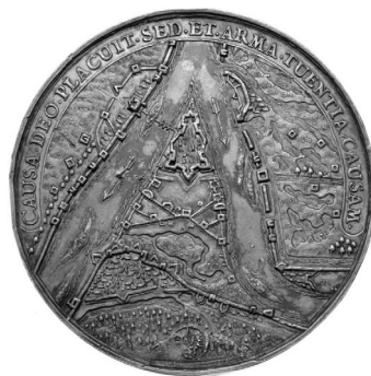
Fig. 3. The fortress of Głowa Gdańska besieged by the army of Jerzy Lubomirski (1659)

anian units, as well as the very moment of seizing the fortifications (J. Czajewski 2011, M. Stahr 1990, pp. 72–73; M. Kupczewska 2010, pp. 36–43). The other one is a medal authored by Jan Höhn Jr., cast in 1659 in Gdańsk (A. Więcek 1972, p. 122; fig. 3). It commemorated the conquest of the fortress of Głowa Gdańska (German: Danziger Haupt ), besieged since 1657 by the Swedish army 9 . Naturally, these are not the only examples. Other worthy of note include the victorious Battle of Khotyn in 1673, which was commemorated on medals with an interesting depiction of the attack of the Crown army on the Turkish camp (E. Raczyński 1845,