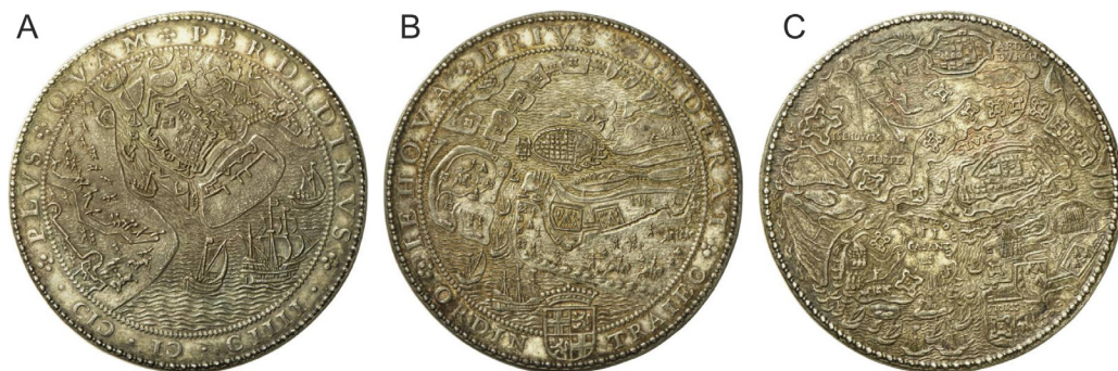
Fig. 1. Medals commemorating the capture of Ostende and Sluis in 1604 during the Eighty Years' War [Landesmuseum Württemberg—Inv.Nr: MK 22550, 22552, copyright: CC BY-SA]

Netherlands in 1604 by Spanish, as well as the seizure of the Spanish Sluis fortress by Maurice of Orange 3 . These works of medallic art undoubtedly used fortification plans made by military engineers and even small-scaled maps used during the wars (fig. 1). Being exclusive and valuable objects made of metal, medals outlived their manuscript originals by centuries. What is more, the transfer of cartographic works into medals suggests that military cartography was regarded an art and highly esteemed just as other arts 4 .