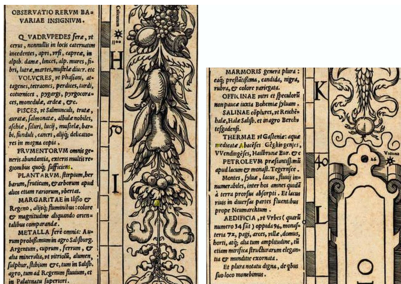
Fig. 3. “Remarks on peculiar things in Bavaria” on sheet no. 12 of the map by Ph. Apian, 1568

Another map entitled Principatus Silesiae Schwidnicensis secundum ejusdem Circulos Schweidnitz, Striegau, Bolckenhain-Landeshut et Reichenbach divisi et geometr. a I. W. Wieland geometrae et locumtenente dimensi exactissima tabula geographica ob praematuram mortem authoris denuo rectificata per Caesareum locumtenent: architect. militarem Matthaeu Schubarth at a scale of approx. 1:125,000 included in Atlas Silesiae published by the Imprint of Homann's Heirs in 1750 also constitutes a suggestive example of the continuity of a similar manner to present geological