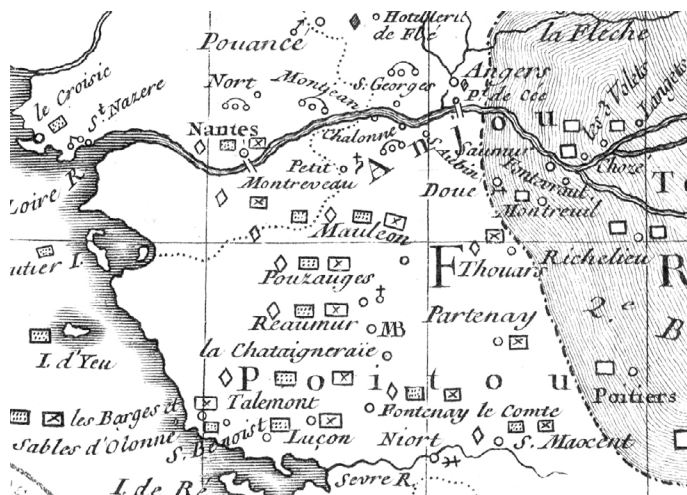
Fig. 6. A part of the map by J.-É. Guettard, 1751 presenting natural resources in the area between Loire River and Sevre River

on the 22nd of December 1762 23 . The topographic base consists of a river network, administration borders, towns and the terrain depicted with mounds. Although its title and the title of the dissertation accompanying it suggest that raw materials were presented, the geological information about minerals in the area of Poland on the map is very modest. In the area of norther and central Poland only