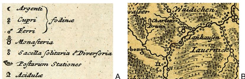
Fig. 4. A – a part of the legend, B – a part of the map Principatus Silesiae Schwidnicensis (Duchy of Świdnica), 1750 (the collection of the National Library of Poland in Warsaw)

cerning the mines in the legend remained unstructured and sign graphics – apart from a jug to mark places where water is collected – are random (fig. 4).