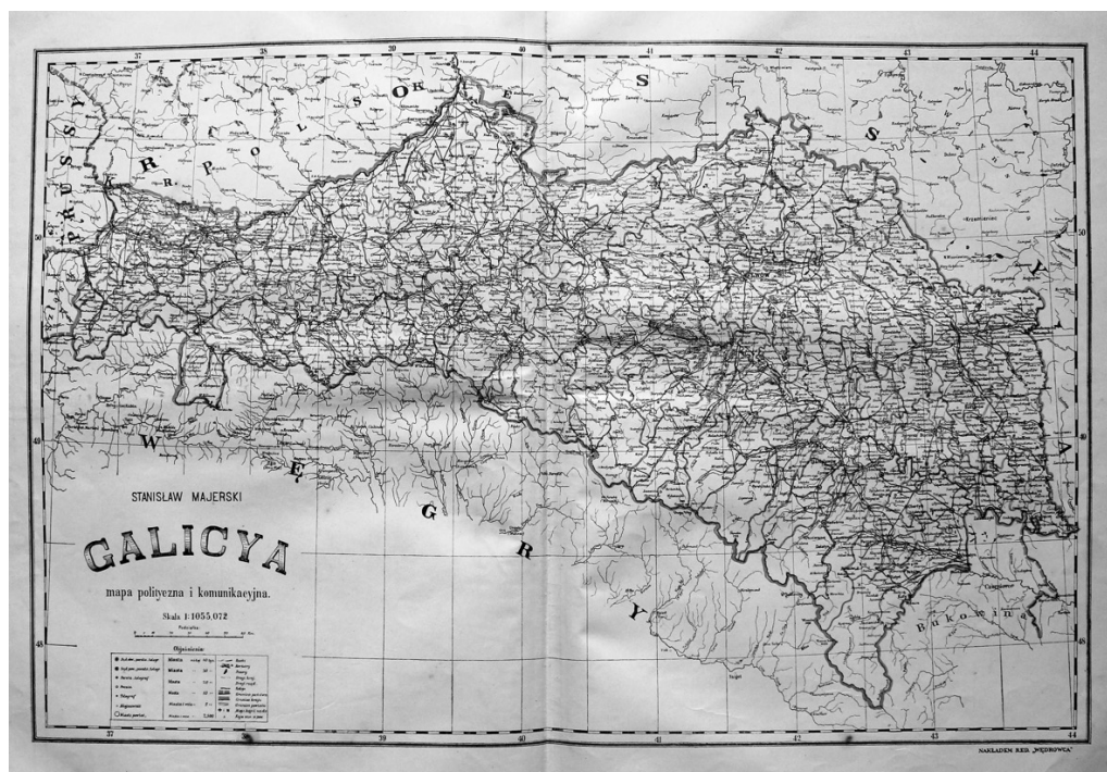
Fig. 3. The map of Galicia from Wielki Atlas Geograficzny (The Great Geographical Atlas) by W. Nałkowski and A. Świętochowski

the volume of an atlas is a number of the names on an index. In the discussing adaptation almost every map (with the exception of the first tables) has its own separate index. Summing up roughly the number of geographical names, we get