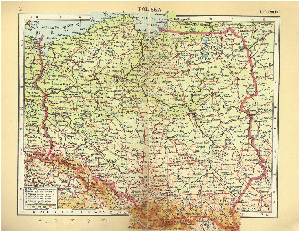
Fig. 4. The map of Poland from Atlas kieszonkowy (The pocket atlas) by K. Kuchař and J. Kondracki

The publisher of the atlas was the Publishing Bookstore Trzaska, Evert and Michalski, hence in the bibliographical records the publication also appears as: Trzaski, Everta i Michalskiego atlas kieszonkowy (The Trzaska, Evert and Michalski pocket atlas). Both issues were printed in Prague.