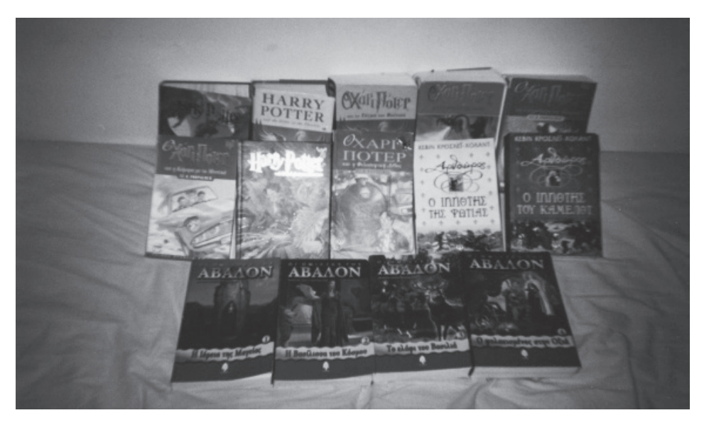
Figure 2. A 14-year-old Girl's Favourite Books: Harry Potter and Avalon (in Swedish and Greek)

The second photo (see Figure 2) was taken by a 14-year-old girl who was very fond of Harry Potter; exemplifying the global feature of the contemporary media landscape (Nielsen Media Research, 2007). The girl confessed, "I love to read; dreaming away to another world". With these words she explained not only why she had taken a photo of her favourite Harry Potter books, but also of Avalon by M. Bradley. Based on this photo, the researcher and the girl talked about various issues related specifically to Harry Potter (reading books, watching the films and participating in forums on the Internet to discuss Harry Potter with other fans), and also about reading in general, reading in Swedish and Greek and comparing Greek and Swedish children's books. While discussing the photo, the girl also talked about how she, influenced by reading Harry Potter, had started to enjoy reading other fantasy books and that she had begun to write her own fantasy stories, which in turn were published on the Internet. Once again we see how one specific photo raised several issues during the interview. Another observation is the effort the girl has put into arranging the books in order. While the girl did not mind mixing the books about Harry Potter in Swedish and Greek, she categorized the books based on the content: Harry Potter and Avalon. The photo is also an example of how the photo is constructed in a certain context with the aim of being presented to another person.