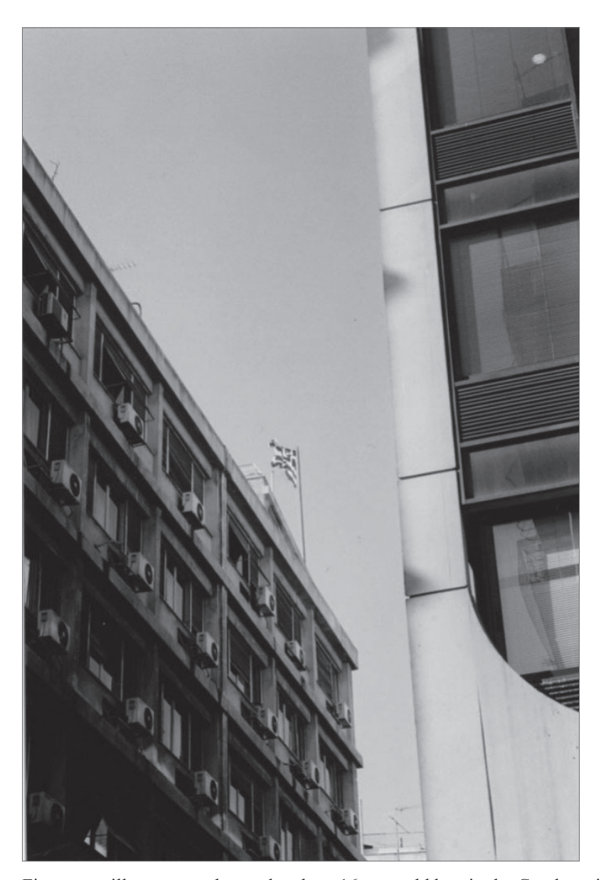
Figure 1. A 16-year-old Boy's Photo

Figure one illustrates a photo taken by a 16-year-old boy in the Greek project. The boy explained to the researcher the reason for taking the photo: