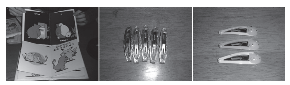
Figure 3. Left: Pokemon Books, Middle: Fancy Hair Pins from London. Right: Fancy Hair Pins from Japan

Thus, although the children in the U.K. study were too young to talk specifically about identities and belonging, some symbolical forms in the photographs taken by the children led the researcher to realize that they had already developed the idea that their lives are in two countries.