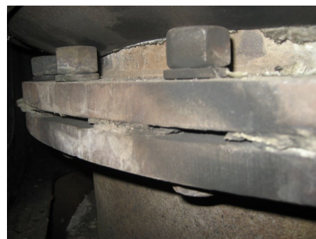
Fig. 2 View of a blown out seal in the connection of the boiler with the exhaust collector of a utilization thermal-oil boiler

In the case of an inappropriate boiler servicing, explosions and fire can take place in the boiler working areas on the heat exchange surfaces. They are favoured by more pronounced soot depositions on the heated surfaces. Such situations may especially arise during uncontrolled overloading of diesel fuels cooperating with utilization boilers, faulty exhaust blow or lack of heat reception from exhaust gases [3]. An example of destruction of a connection between a boiler and a collector of exhaust outlet throughout blowing out a seal as a result of fire and an explosion inside the boiler and as a consequence in the vicinity of boiler mounting is shown in Fig. 2.