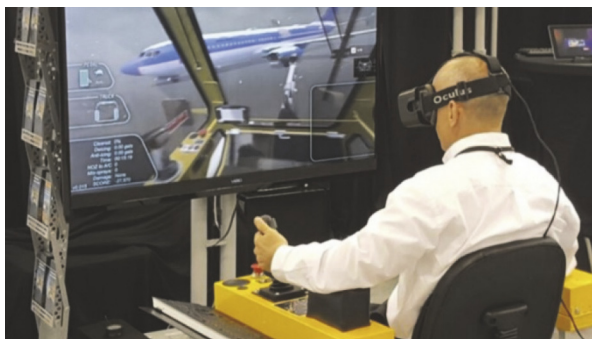
Picture 6. Aircraft de-icing operator training simulator

Source: http://forgefx.com/simulation-projects/aircraft-ground-support/deicing-training-simulator/ , [accessed: 14.09.2017 r. ].