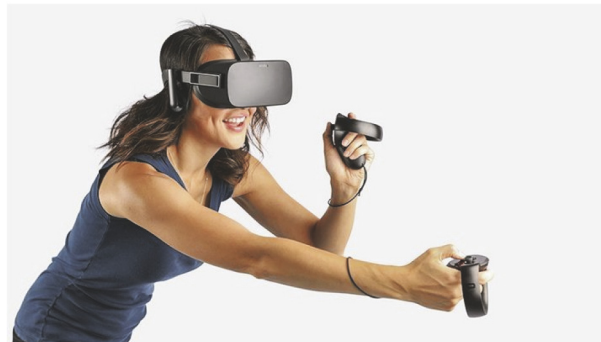
Picture 4. Gogle Oculus Rift

Source: http://www.gry-online.pl/Galeria/Html/Wiadomosci/197901994.jpg [ accessed: 20.09.2017 r.].