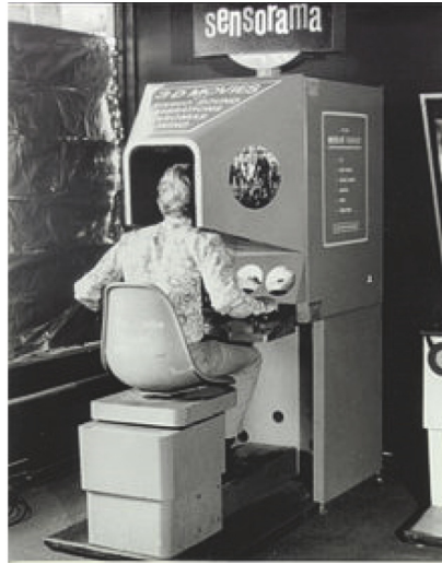
Picture 2. Sensorama

Source: http://www.retronauta.pl/sensorama-analogowa-rzeczywistosc-wirtualna , [accessed: 21.09.2017 r.].