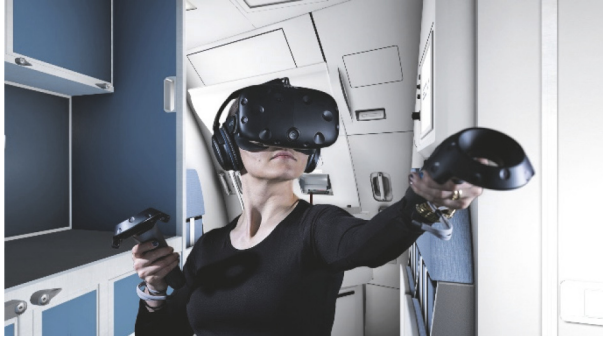
Picture 5. Training for personnel using a VR simulator

Source: http://www.adsadvance.co.uk/media/images/2017/EDM%27s%20VR%20Door%20Trainer.jpg , [accessed: 13.09.2017 r.].