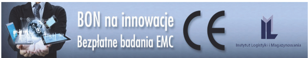
Figure 5. Banner ad posted on elektronikab2b.pl subpages