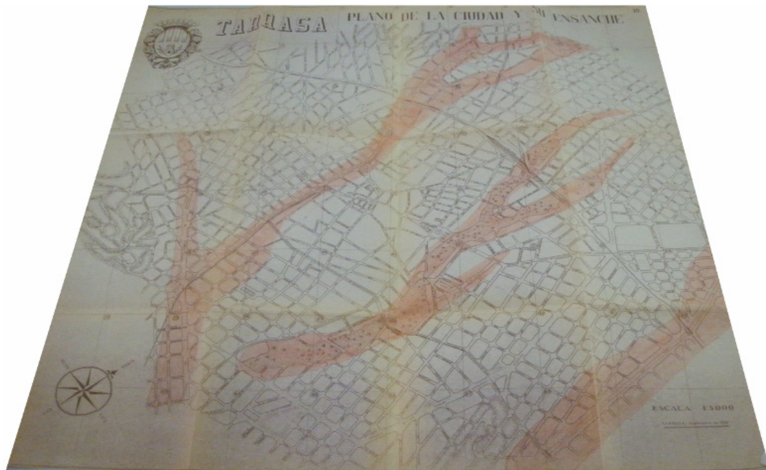
Figure 3. Perspective view of an old city map showing the areas of Terrassa most badly affected by the flood of 1962. Clearly they coincide with the courses of the three main rieras in the city.