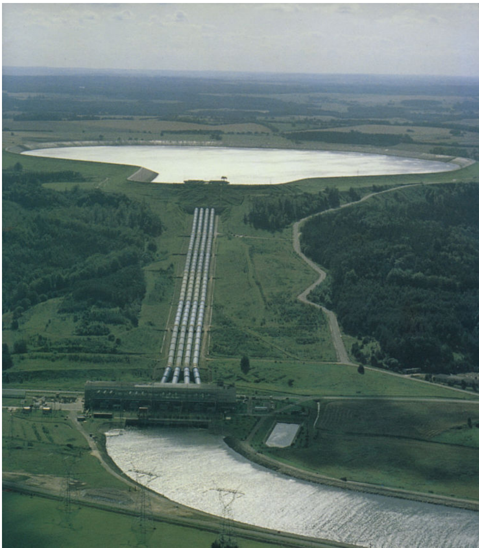
Photo 1. The largest peak-flow pumped-storage hydro power station in Poland: Żarnowiec on Lake Żarnowieckie.