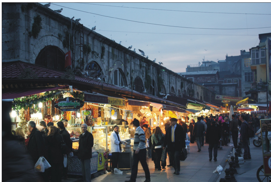
Fig. 1: The Egyptian Bazaar (Mısır Çarşısı) in Istanbul is one example of traditional retail in Turkey. Today it is a tourist attraction.

The aims of the Turkish institutions were to organize an effective and affordable food supply for the urban population and to control the black market. The municipality of Istanbul and the Turkish government believed that foreign knowledge was needed to improve