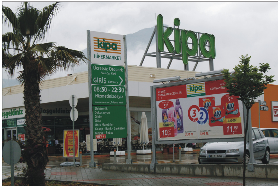
Fig. 3: Kipa store in Fethiye. The hypermarkets belong to the UK-chain Tesco