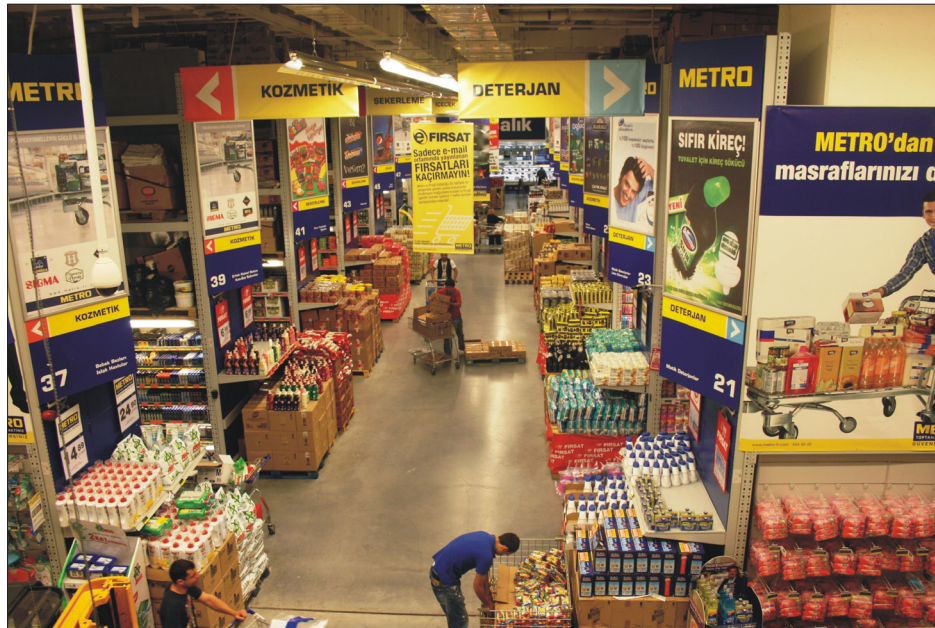
Fig. 2: Metro Cash&Carry store in Istanbul