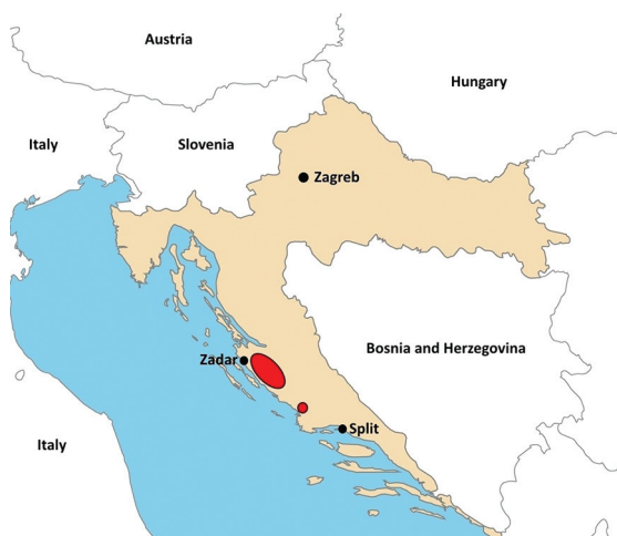
Figure 1. Geographical location (red circles) of experimental farms in the Dalmatian hinterland

Muscle fat content for fatty acid analyses was extracted with a chloroform and methanol mixture (2:1, v/v) (14) at 0 month and six months. The fatty acids were analyzed as their methyl esters, after transesterification with a 2M KOH solution in methanol. Analysis of fatty acid was performed on GC2010Plus Gas Chromatograph (Shimadzu, Japan) equipped with a flame-ionization detector. The capillary column used was ZB WAX (Phenomenex, Torrance, CA, USA), 30 m x 0.25 mm with film thickness of 0.25 µm. The injector temperature was set to 250°C and 1 µl of each sample was injected with a split ratio 1:15. Helium was used as the carrier gas and the detector temperature was set at 300°C. The oven program was as follows: the initial temperature was set at 60°C for 2 min, then increased at the rate of 13°C/min up to 150°C, then increased at 2°C/min up to 220°C, increased at 2°C/min