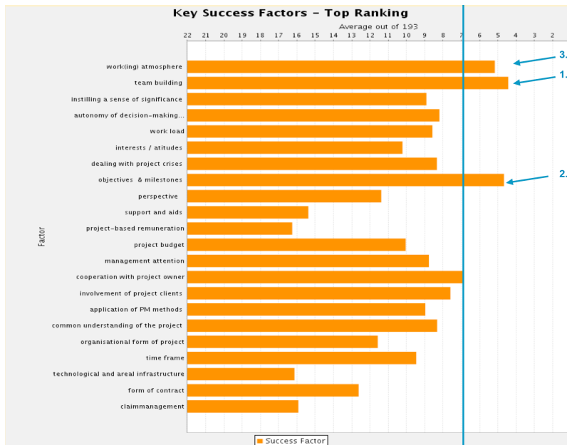
Figure.1. Key Success Factors of Project Management.

FELLNER Executivetraining und Consulting [2008]