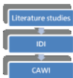
Figure 1. Research process.

The article attempts to answer a question how does the usage of metaphors for the process of negotiation differ across cultures. The research was based on literature studies, IDI and CAWI (Fig. 1). IDIs were conducted from the beginning of May until the end of July 2012 and British sample was added from in July 2013. CAWIs were obtained in July and August 2013.