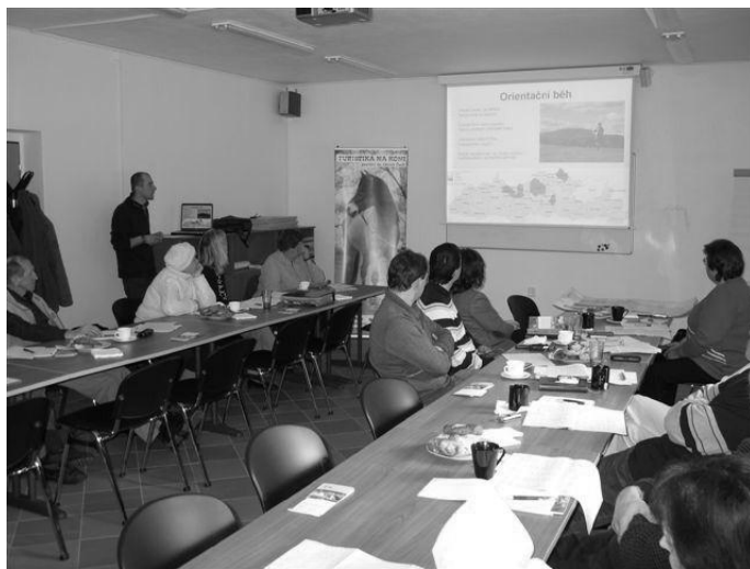
Fig. 4: Round table with mayors of the Šumava Biosphere reserve villages – Modrava, July 3, 2007.

The scope of the project was too complex to be executed by one expert or institution. As a result, one of its main „social by-products“ was an establishment of several social networks, partly overlapping, by use of which particular project activities were realized. Šumava National Park and Protected Landscape Area Administration, Regional Development Agency Šumava, Regional Environmental Centre Czech Republic, as well as NEBE Agency formed a core of these networks, coordinated as a rule by the Institute of Systems Biology and Ecology AS CR. In parallel to forming social networks, network of projects emerged around individual activities. In this manner, the UNEP-GEF project was linked with two INTERREG-type projects – PANet (Protected Areas Networks – Establishment and Management of Corridors, Networks and Cooperation) and Certification of Local Products in the Šumava Mts., pooling thus experts, know-how and financial resource with the aim to use them as much as effectively 2 (Těšitel et al. 2007; Kušová et al. 2008a).