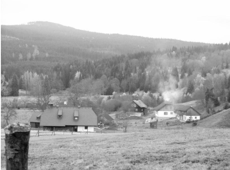
Fig. 1: Šumava Mts. – scenic view.