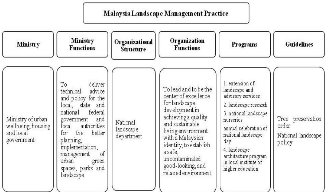
Fig. 1: Landscape management practices in Malaysia

The municipality landscape recreation department has been focusing on greenery and landscape sustainability, with a particular focus on providing amenities for the public and working on the beautification of the city to achieve the goal of becoming a world-class sustainable tropical city by 2020 (Municipality) as shown in Figure 1. For Kuala Lumpur, a city of parks and facilities for all people, beautification programs and the establishment and maintenance of park areas are ongoing year to year (KPKT, 2018; TKPK, 2018).