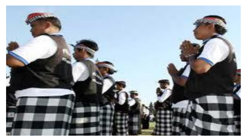
Fig. 3: The Use of Black-White Clothes for Forest Guards