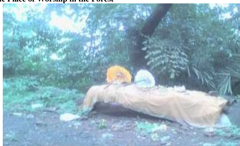
Fig. 2: The Place of Worship in the Forest

Place of worship is a sacred building owned by Hindu people, which is a place of worship of God or His-manifestation. The use of black-white clothes in the place of worship is a hallmark of God's power that serves as a spiritual security guard (guardian from spiritual world dimension), which is further expected that security and goodness can be established to obtain a harmonious life. The main task is to maintain the security of the yard or the environment. The worship in the forest as shown in Fig. 2.