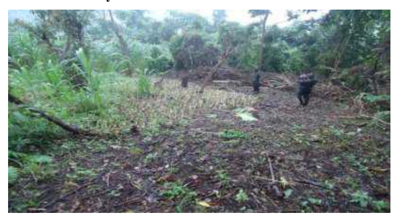
Fig. 1: Past deforestation by local communities

Ironically, forest encroachment is carried out by local people who live around the forest. The results of the causes of community encroachment activities were poverty. A poverty that encodes local communities around protected forest areas encourages them to penetrate the forest.